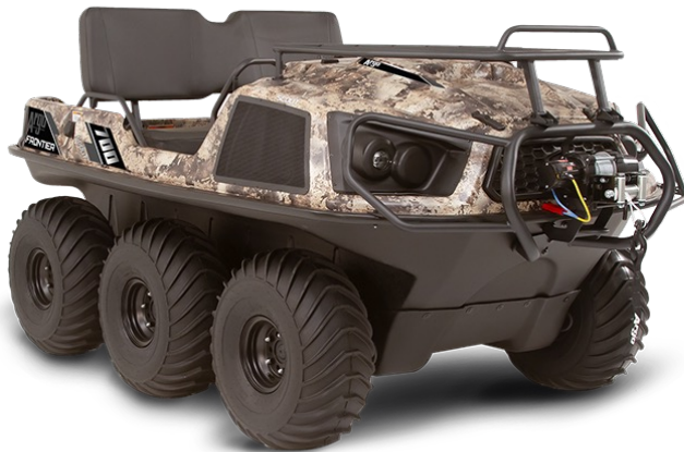
TrueTimber® Prairie Camo